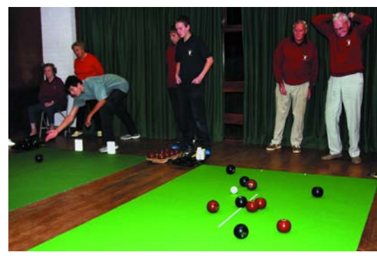
Club, the Table Tennis Club and the Sailing Club (founded in 1954) situated in a glorious location at the Riverbank at Park End. The stretch of the River Great

A number of sporting clubs flourish in the Village, notably the Football Club recorded as active by 1901, the Carpet Bowls