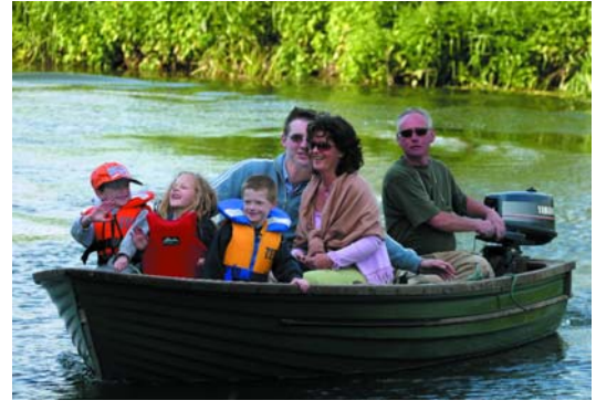
Ouse in Stevington is as beautiful as any stretch of river in England and is very popular with fishermen. The Cricket Club was founded in 1882 and enjoys a mag-