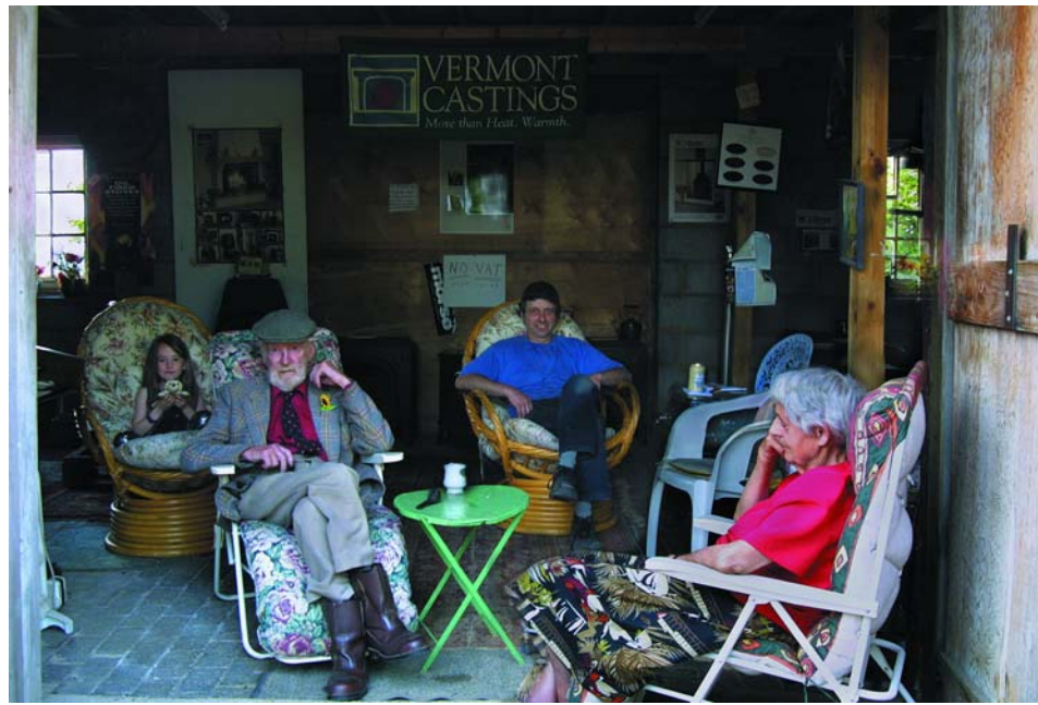
Stevington: The Village in Action

In the first article we described the Village and its setting. Within that setting there operates a lively community. Anyone who comes to live in the Village realises very soon that they have joined something unique, if not to Stevington then to the English 21st Century rural community. They find that the place ticks.