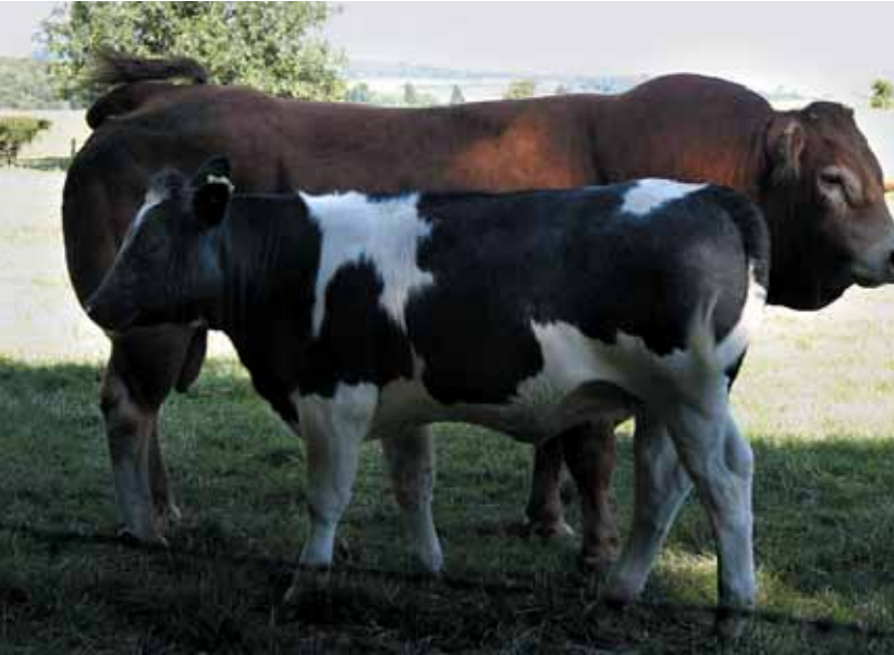
60 Bigger Business Sizes Up a Mate