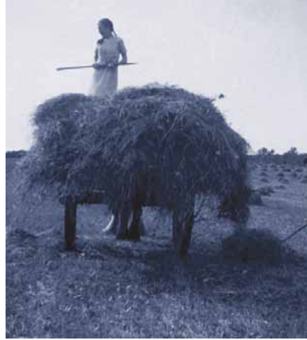
46 The Hay Wain: Brenda Stanbridge and Alf Sw