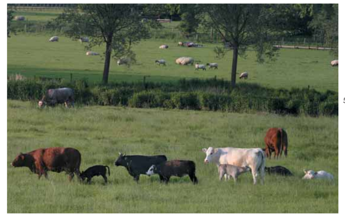
55 A Similar Scene Today at Hart Farm