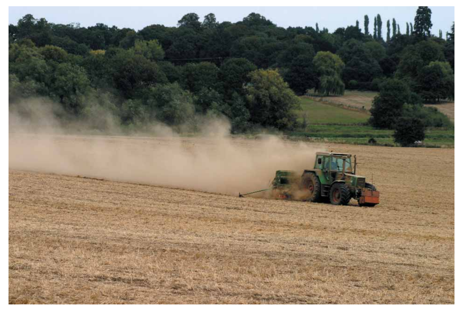
49 Drilling with Dust