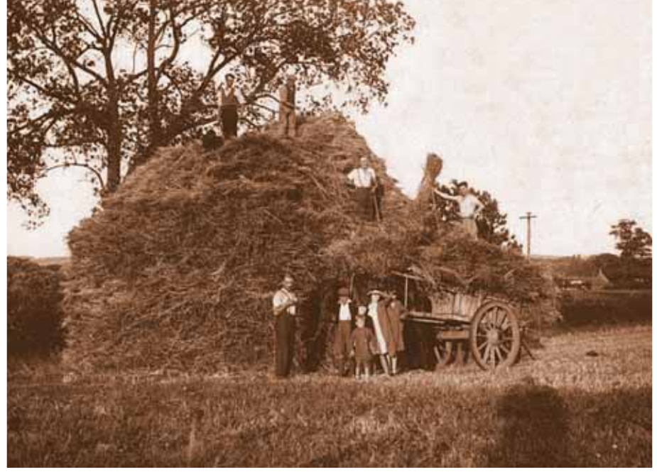
45 Stacking Wheat Sheaves in a Round Stack