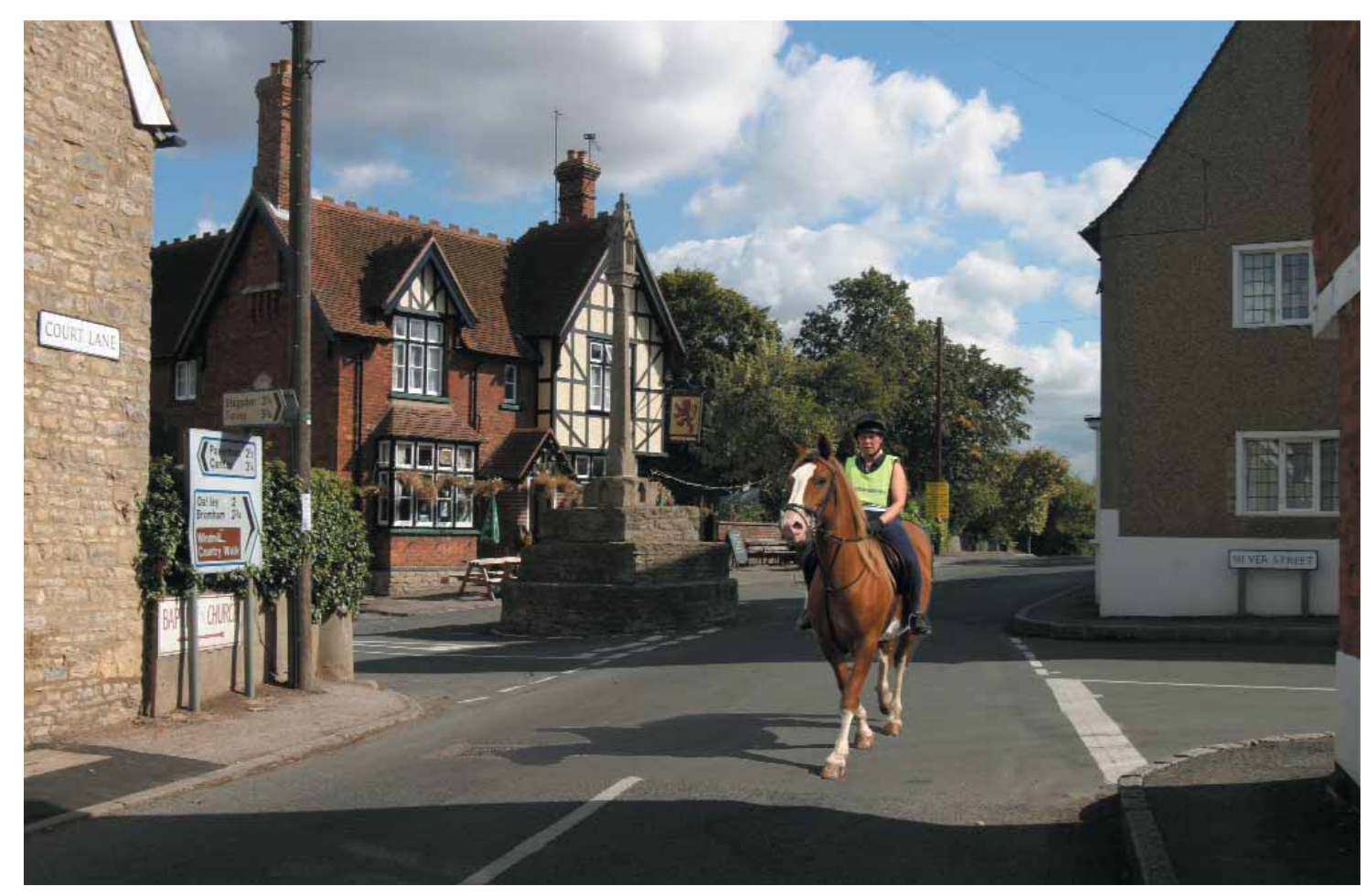
65 Not Quite Banbury