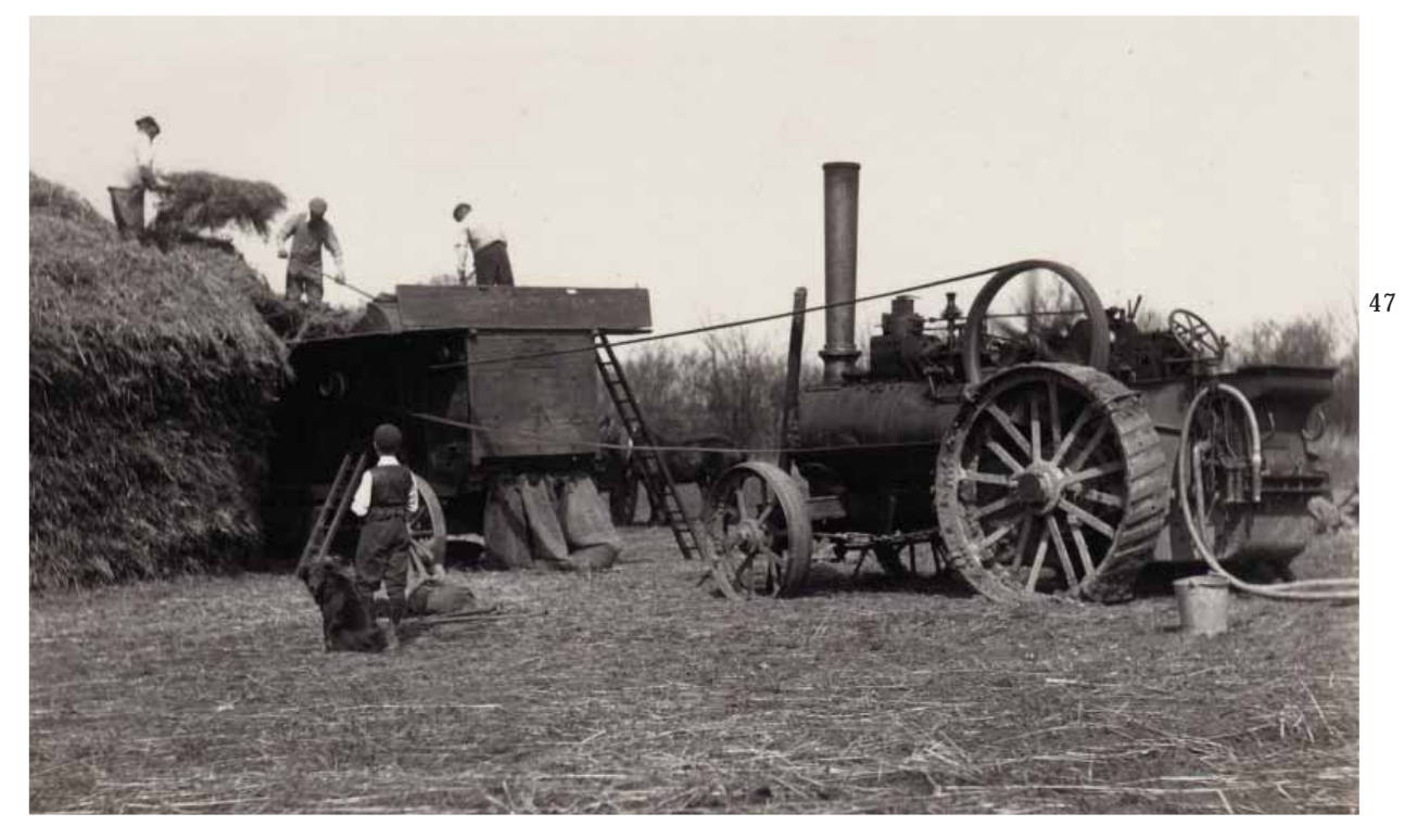
7 Steam Threshir c. 1910