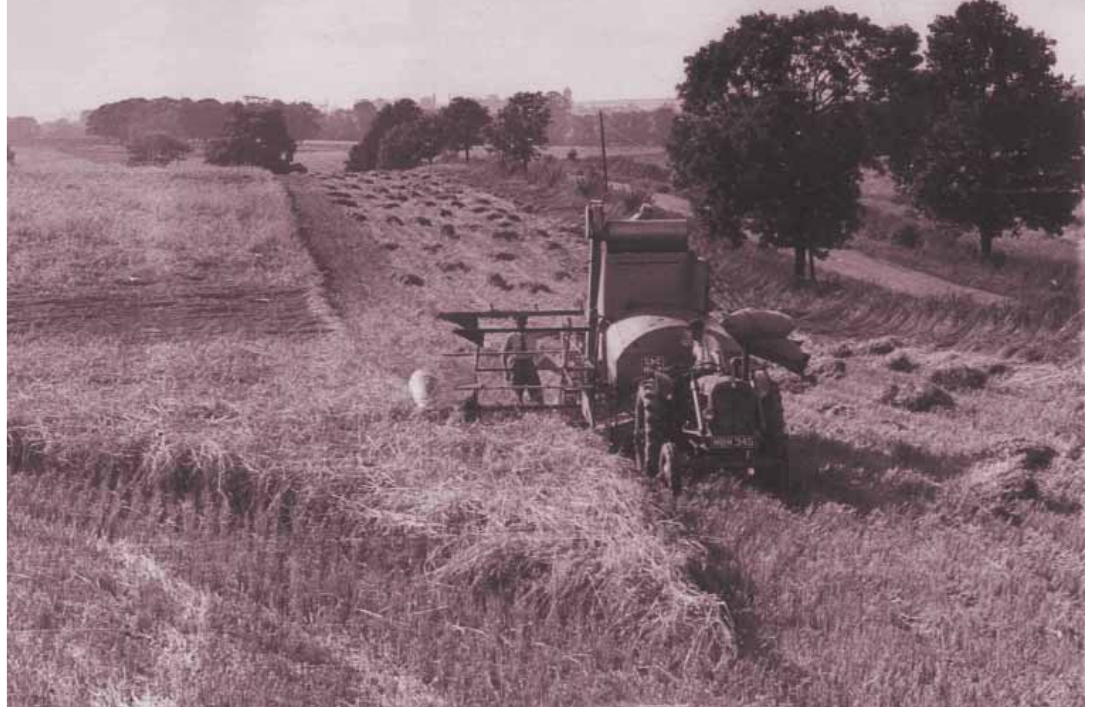
48 Ken Prentice with Combine c. 1948