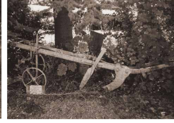
43 Horse-Drawn Plough c. 1880