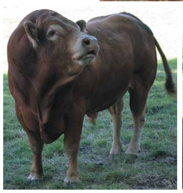
59 Enter Bigger Business